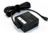
Dynabook 65W USB Type-C PD 3.0 AC Adaptor (PA5352E-1AC3)